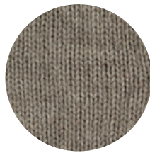
Light Brown 002